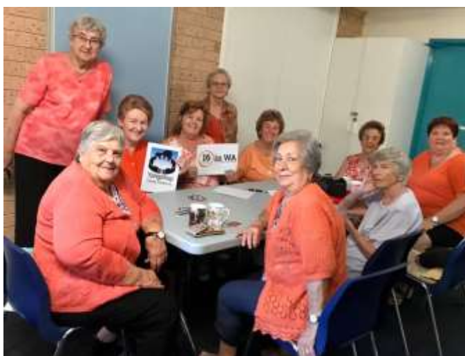
Yangebup Leisure Group supporting 16 Days in WA