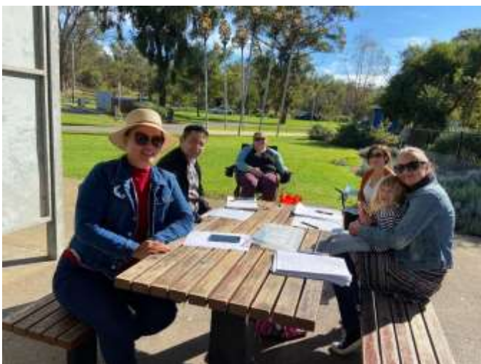
Connecting Community for Kids Celebrate Culuture Action Team meeting in the park

We attended numerous events in our local community to promote our services, to support our partners and to create new opportunities.