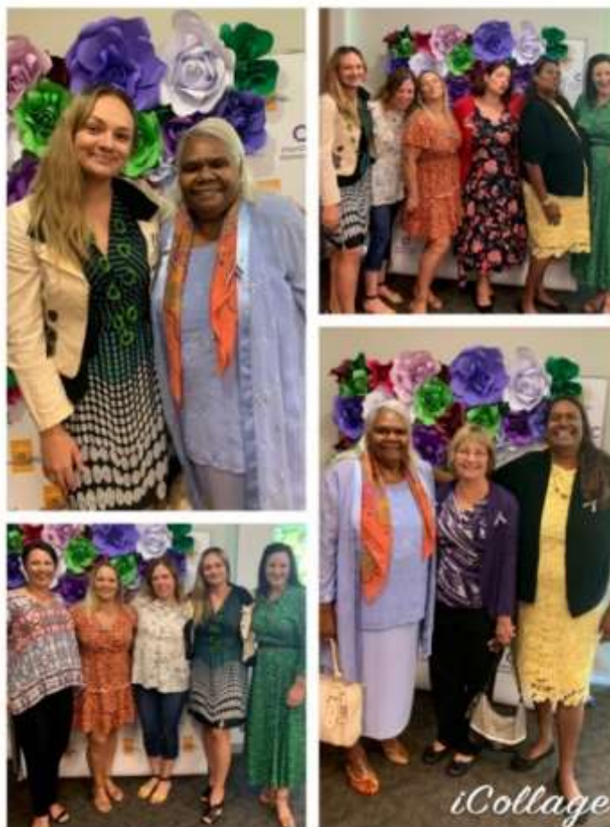
Staff and Committee attended International Women's Day event held at the City of Cockburn.

These events raise awareness about others and provide support pathways to individuals and families.