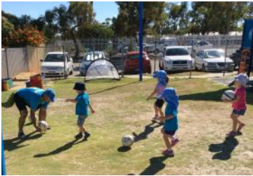
Soccer Visit to Kindy

This has been an amazing first term. Staff have shown great enthusiasm settling the children into kindy. It has been an eventful term for the staff and management as we have just gone through our assessment and rating process the week ending the 4th March. We are still waiting to hear back from the Education and Care Regulatory unit (Department of Local Government & Communities). Once we have received our rating, it will be displayed on our notice board.