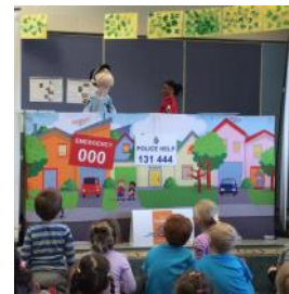
Constable Care puppet show

Occasional Care is available Monday, Wednesday and Friday.