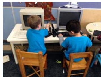
The office setup was a big hit!