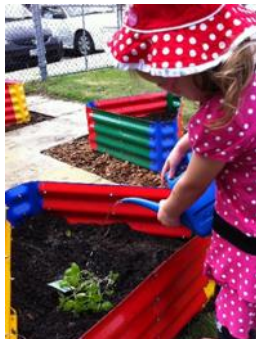
Caring for our garden in Kindy