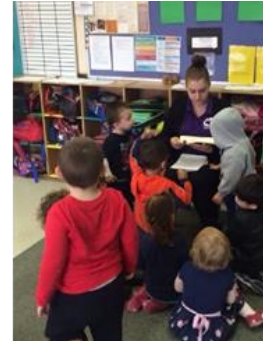
Looking closely at a snail in Occ Care